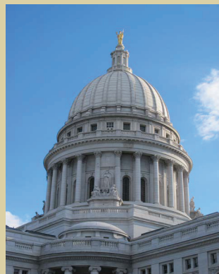
The Wisconsin State Capitol Building, Madison, Wis.

610 Langdon Street Lowell Conference Center has reserved a limited block of rooms for the Symposium. Our room block will be released Oct. 6. Paste this URL into a new browser window to reserve online: http://bit.ly/knitting08nove To make reservations by phone, call (608) 256-2621, and please refer to the group code: KNITTING Two-block walk to Symposium Events.