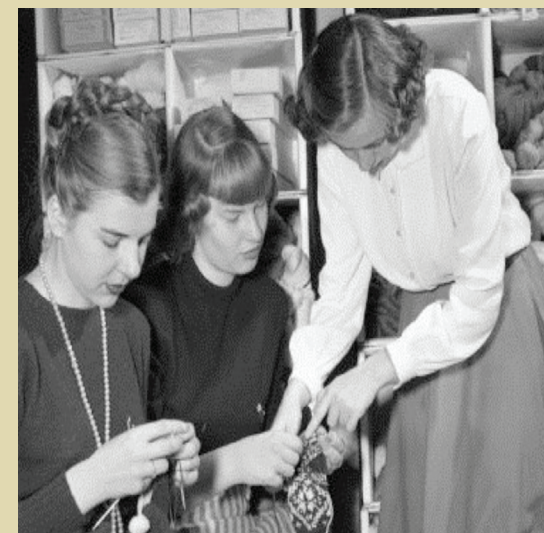
Sorority Girls Knitting for Hospital Patients, Madison, Wis., October 11, 1948

A Symposium to Explore the Case for Collecting, Preserving, Researching, and Sharing Our Knit and Crochet Heritage